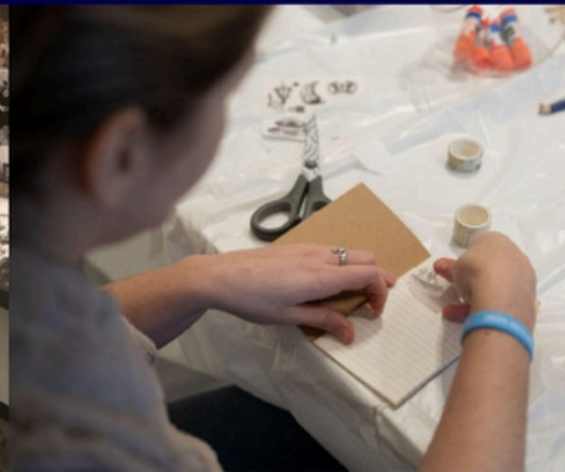
Right photo by Shay Markowitz for the Toronto Holocaust Museum